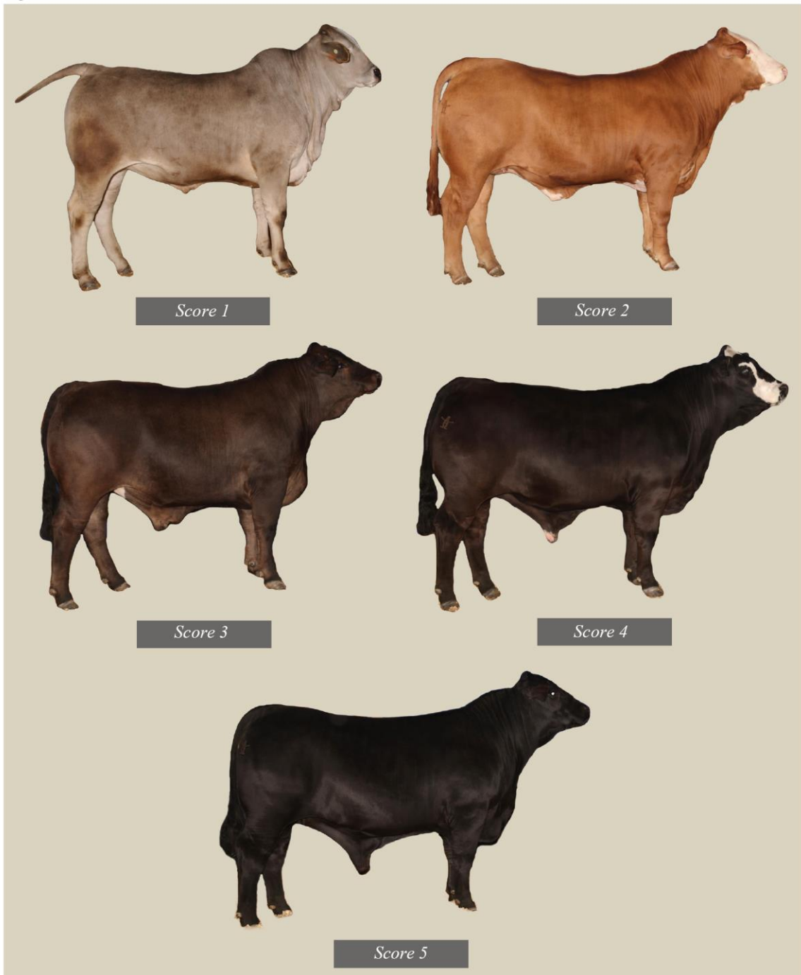
Figure 1. Sheath Scores